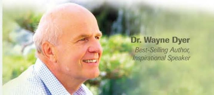
Dr. Wayne Dyer Best-Selling Author, Inspirational Speaker

"Everything is energy. Everything and everyone has a frequency. Those frequencies that are out of balance with our natural harmony can be identified and removed. I know this to be true. I have seen the Sanctuary process at work. This is real, it is transforming, it is true healing. It is available now."