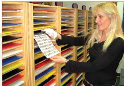
Photographs are used to receive the energies.

As an AIM participant, you will have access to thousands of balancing frequencies 24 hours a day, 7 days a week.